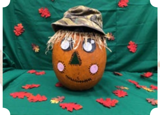
Stan The Scarecrow